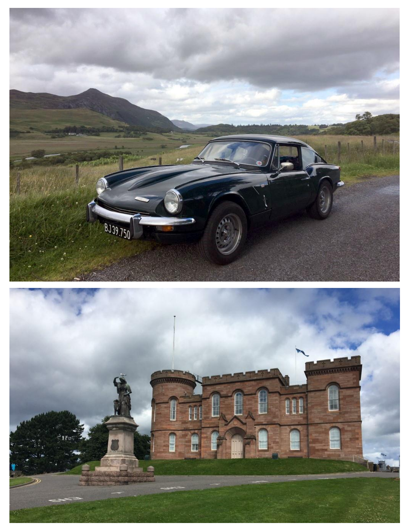
Scottish landscapes (above and in the next pages).