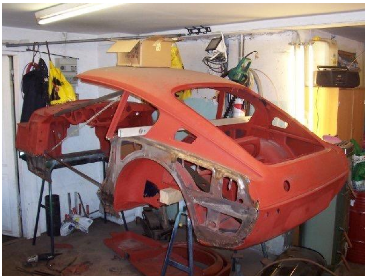
Restoration in progress.

It took me 13 years to build the car, working on it depending on time and money, but in 2013 I finally turned the key and the straight six was firing up. Now I drive my GT6 very often and it runs well. At 4000 RPM in 4 th with overdrive it gets to 122 km/h and the elapsed time from 0 to 100 km/h is quite good for a 50 years old car.