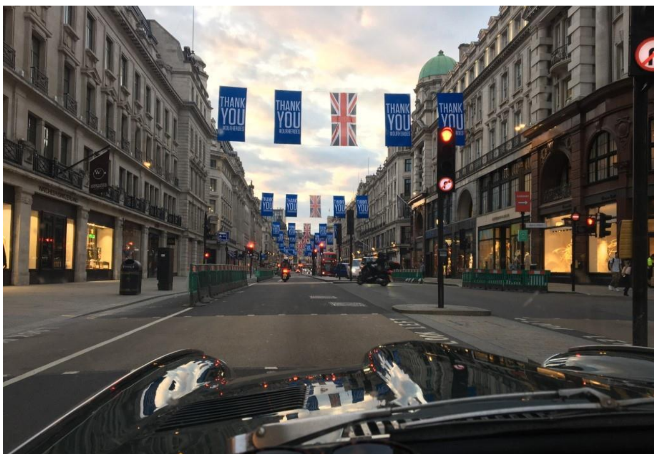
An unusually deserted London.